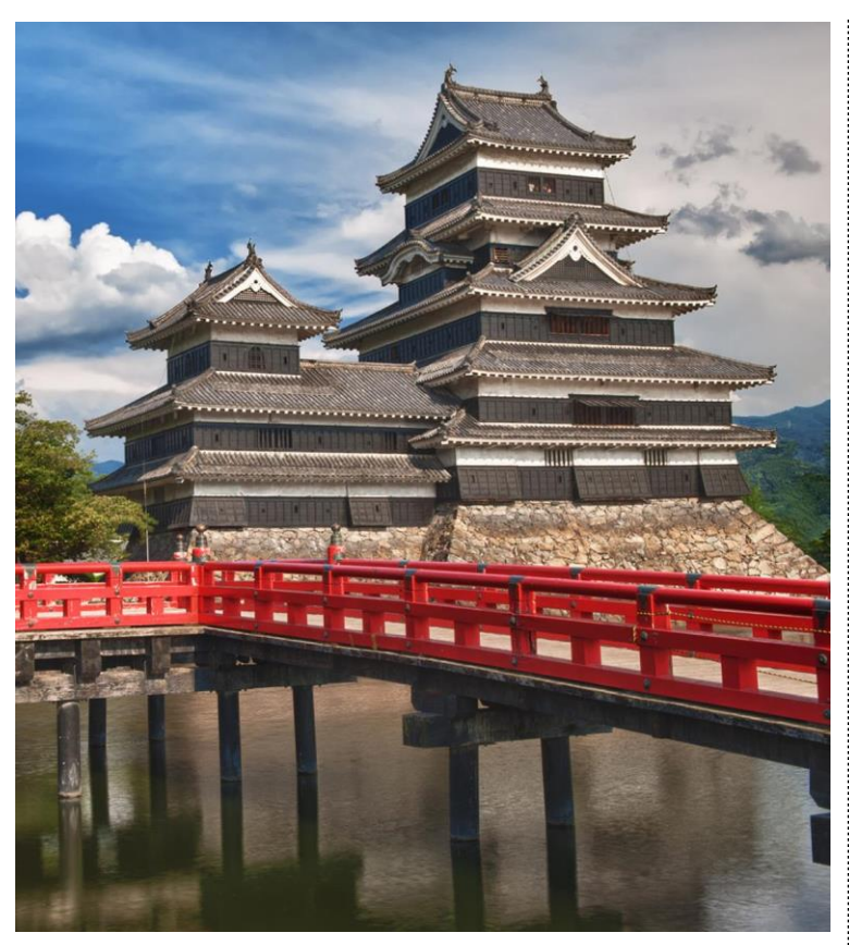
13 Days • 18 Meals: 12 Breakfasts, 6 Dinners

HIGHLIGHTS... Tokyo, Ginza, Asakusa Sensoji Shrine, Tea Ceremony, Hakone, Lake Ashi Cruise, Matsumoto Castle, Takayama, Sake Tasting and Hida Beef Dinner, Choice on Tour: Takayama Jinya or Takayama Matsuri Yatai Kaikan, Kaiseki Dinner, Shirakawa-go, Kanazawa, Kyoto, Bullet Train, Hiroshima, Maiko Show